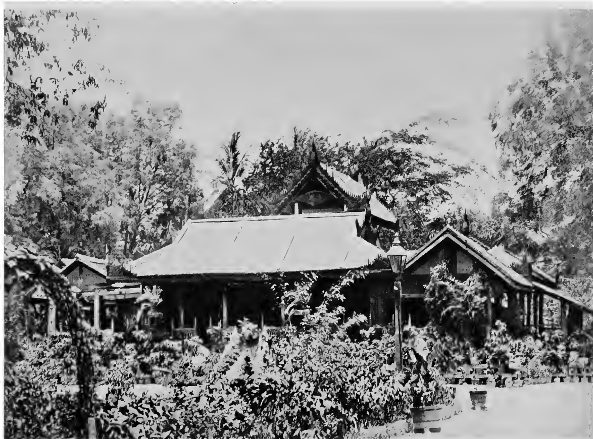
Scene of King Theebaw's Surrender to the British, Mandalay